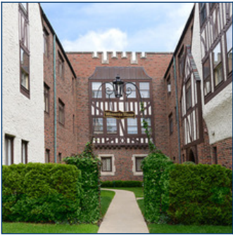
Some photos may be virtually staged